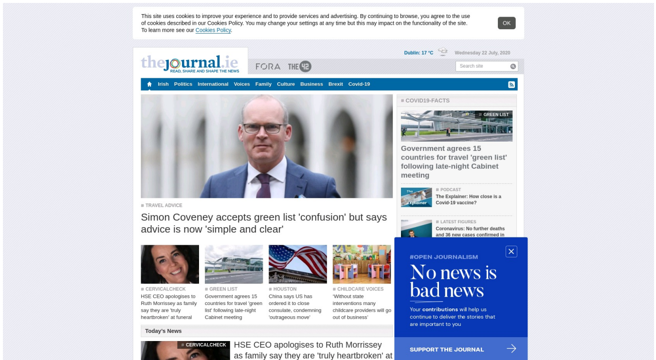
Webpage Top Screenshot